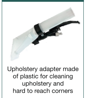
Upholstery adapter made of plastic for cleaning upholstery and hard to reach corners